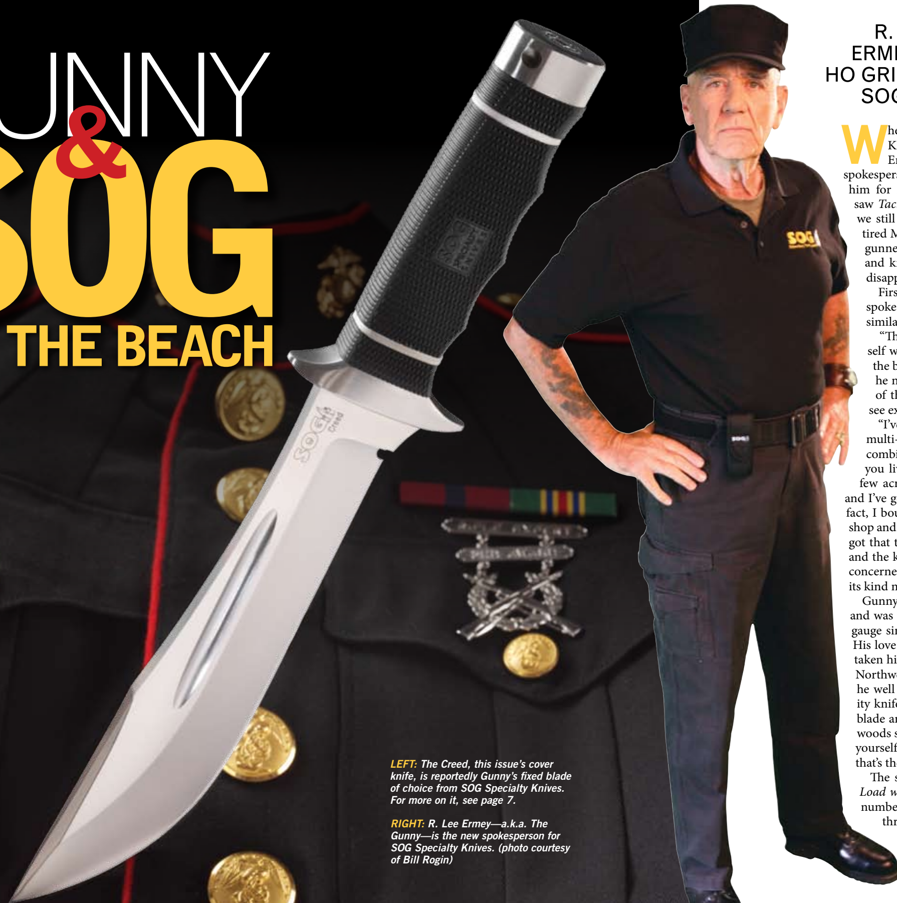
LEFT: The Creed, this issue's cover knife, is reportedly Gunny's fixed blade of choice from SOG Specialty Knives. For more on it, see page 7.