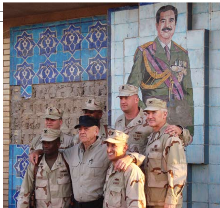
Gunny has made a number of visits to the troops in Iraq and Afghanistan for the U.S. Navy Department of Morale and Welfare. Here he is with a group of Marines in front of Saddam Hussein’s palace in December 2008.

Gunny boarded a military transport, flew to the Philippines where The Boys in Company “C” was being filmed in 1978, landed the part of a Marine drill instructor and his acting career had begun. However, it was 1987’s Full Metal Jacket that, as Gunny put it, “kicked all the doors open.” In it he established his onscreen persona as the gung-ho drill instructor, Gunnery Sgt. Hartman.