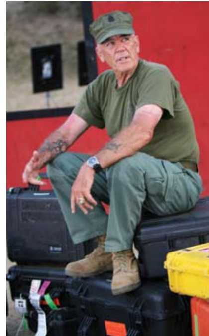
New episodes of Gunny's acclaimed show, Lock N' Load with R. Lee Ermey, appear on the History Channel on Friday nights at 9 or 10 p.m. in some time zones. Check your local listings for the date and time in your area.