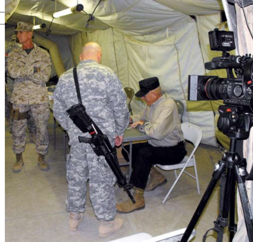
Gunny signs an autograph for a Marine during a morale-building visit to the troops in Iraq during Christmas of 2008.

Not only did the role earn Gunny a nomination for a Golden Globe Award as Best Supporting Actor, it played a key part in his receiving an honorary promotion to gunnery sergeant from the Commandant of the Marine Corps. According to Wikipedia, it made Gunny the first retired military member in the history of the Corps to be promoted. Wikipedia, it seems, needs to check its sources.